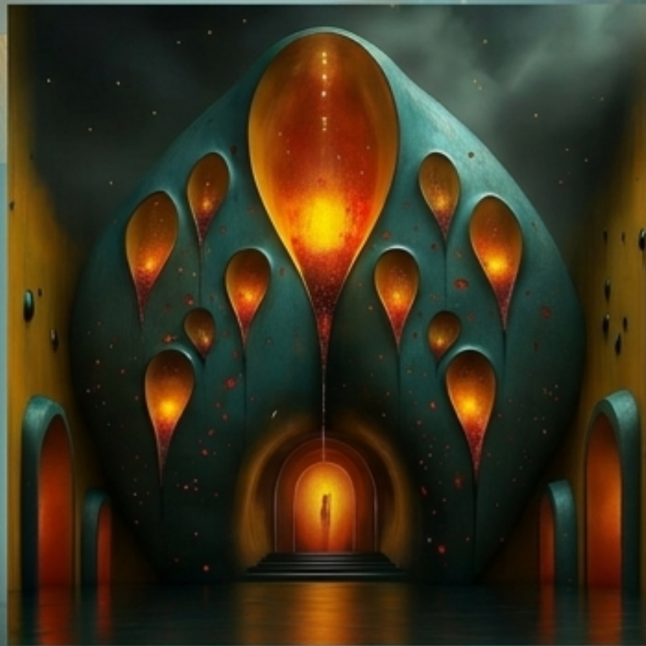
Curated Motif II — Architectural Voids. Showcasing glowing, cavernous spatial artworks. These pieces act as structural extensions of the wall itself, creating the illusion of infinite depth and subterranean warmth. Intended for statement walls, dead-end corridors, and spaces requiring an artificial horizon line.